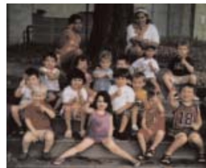
Eatin' home-made popsicles!