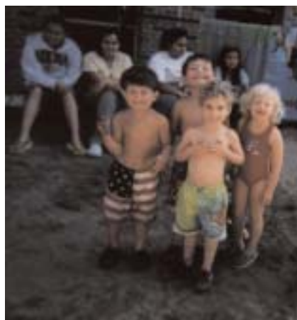
Stayin' cool in the summer heat!