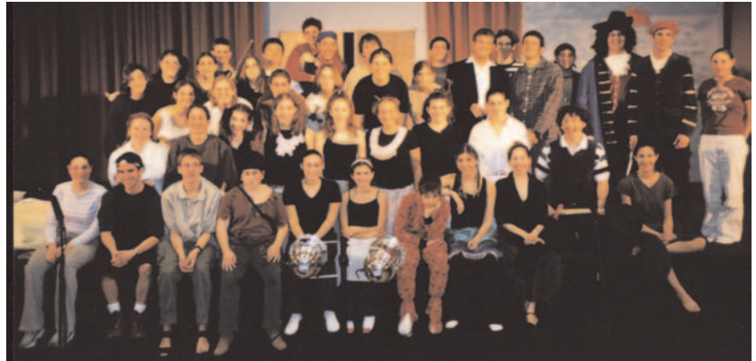
Cast and crew of Peter Pan