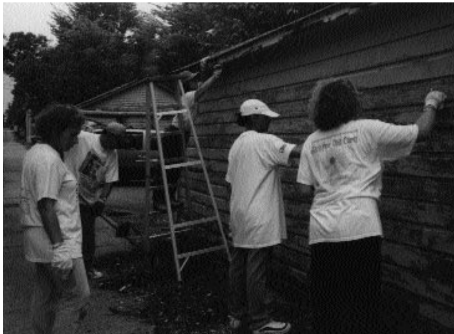
Volunteers hard at work at the Paint-a-Thon